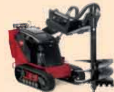
Auger Power Head (up to 24")